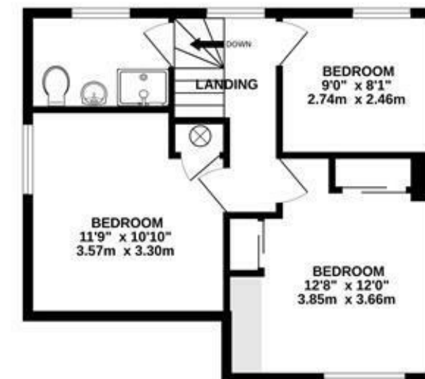
TOTAL FLOOR AREA : 1305 sq.ft. (121.2 sq.m.) approx.

Whilst every attempt has been made to ensure the accuracy of the floorplan contained here, measurements of doors, windows, rooms and any other items are approximate and no responsibility is taken for any error, omission or mis-statement. This plan is for illustrative purposes only and should be used as such by any prospective purchaser. The services, systems and appliances shown have not been tested and no guarantee as to their operability or efficiency can be given.